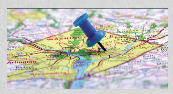
Washington, DC, America

Which country do you live in? What is its main city?